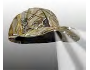
Panther Vision PowerCap

Panther Vision makes a great lighted cap. They are lightweight, comfortable and have the added benefit of 3 LEDs built into the rim. The batteries are concealed under the hat band, and a switch in the brim toggles the LEDs through 3 different modes. Whether you need to see to get to the bathroom at night, or you like to read in your tent, Panther Vision PowerCap LED Lighted Hats fit the bill (no pun intended). 3-LED and 5-LED models are available in several colors for $20.00 - $25.00.